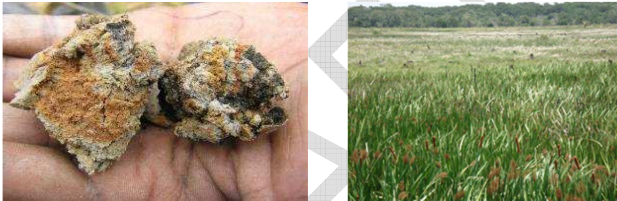
Figure 1 & 2: Mottled soils indicative of a wetland (left) and specially adapted wetland vegetation (right).

In simpler terms, a wetland is a feature in the landscape which is saturated with water for a long enough period that the soil conditions change (mottling as a result of the anaerobic conditions) and the vegetation shifts to respond to these changes.