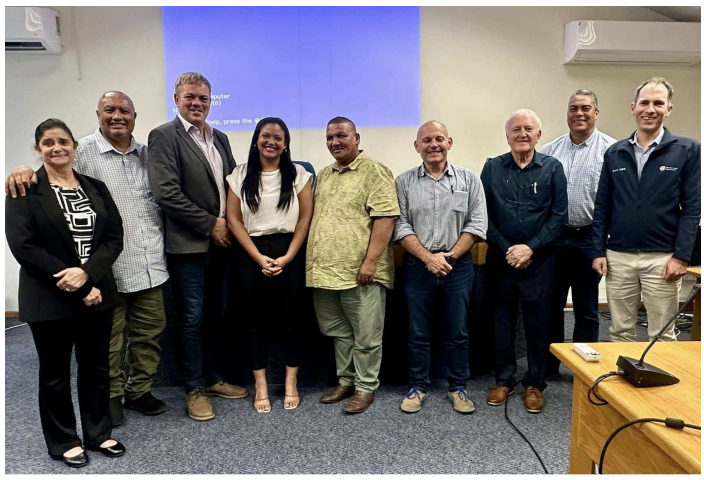
MEC Deidré Baartman (middle) during her visit to the Overberg with Finance MMCs from the district and local municipalities.

"The Western Cape Government has allocated R250 million towards compensation of educators. A further R600 million is made available within the WCED's budget to deal with their immediate teaching post and learner enrolment pressures."