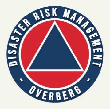
24/7 OPERATING CONTROL ROOM