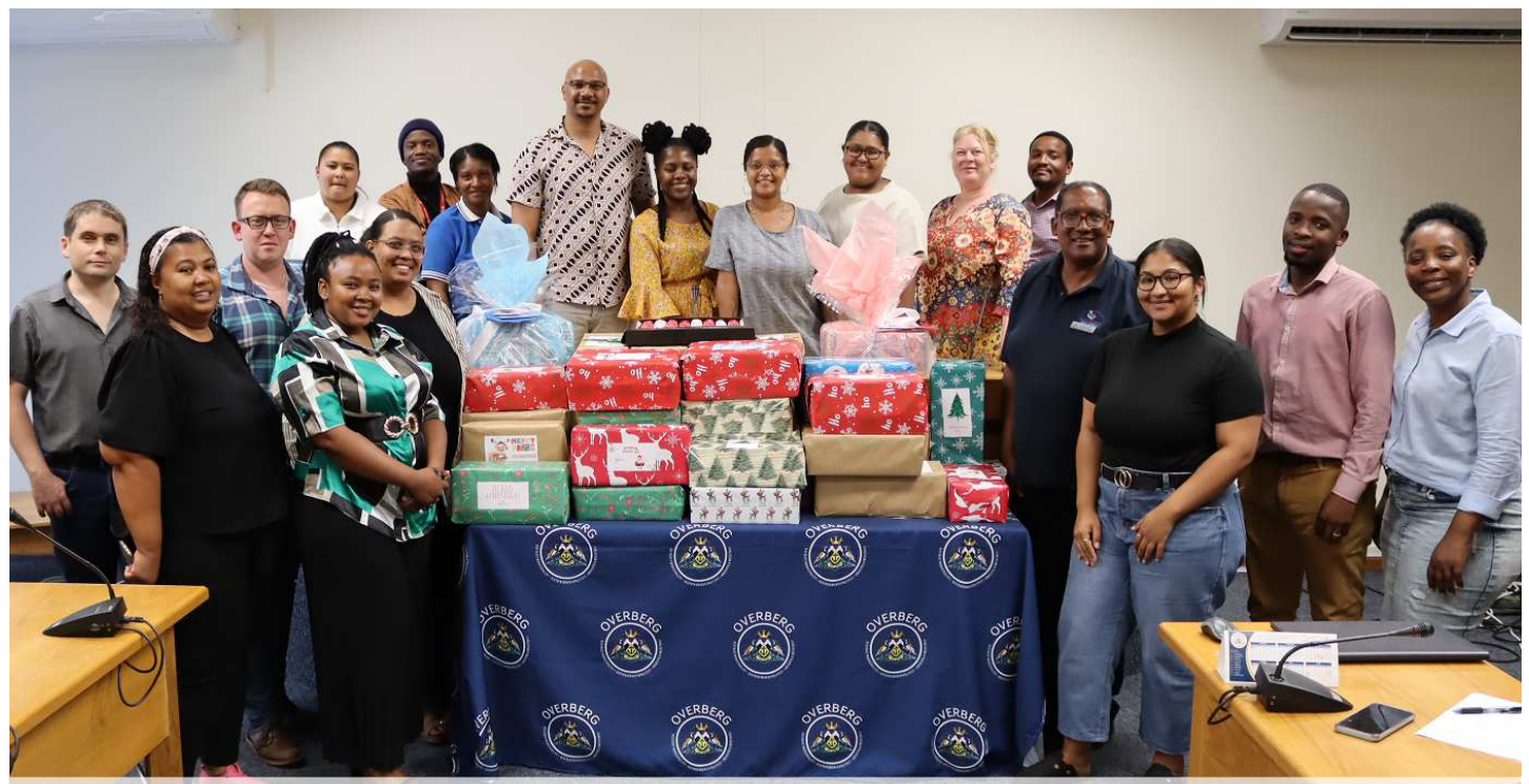
Various departments from the Overberg District Municipality sponsored a total of 35 gift boxes for young girls and boys. This project was part of a community initiative by Child Welfare SA - Bredasdorp.

Child Welfare SA Bredasdorp is a Non-Profit, Child Protection Organization and has been rendering services in the communities of Bredasdorp for many years. The organizations core focus is safeguarding children and preserving families for as long as possible.